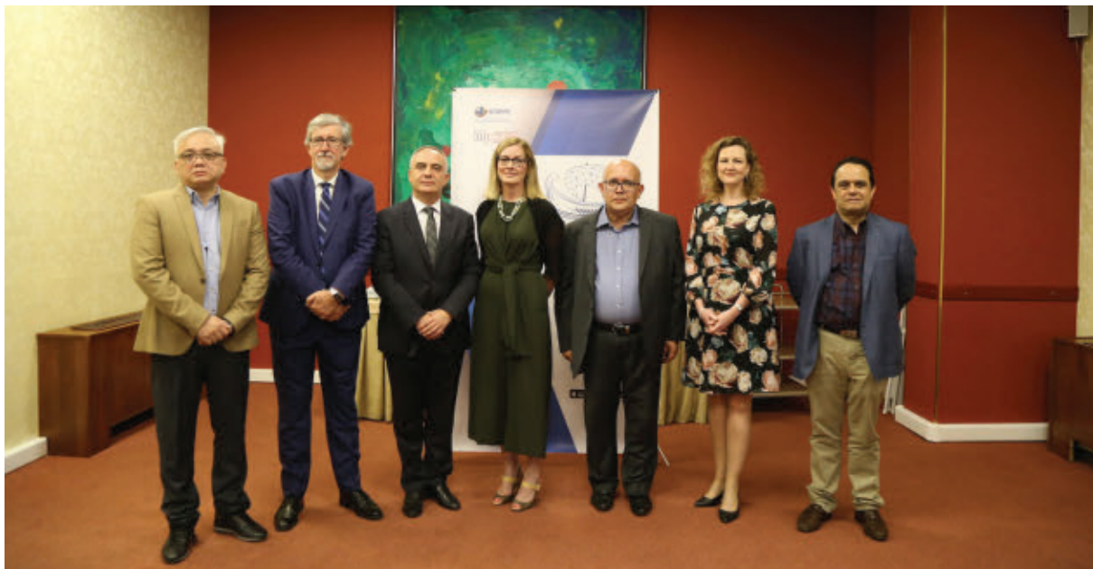
The Closed Session was preceded on 20 October 2019 by the 55th Meeting of ICDPPC Executive Committee.

As the GPA community continues to grow, the 41 st ICDPPC admitted the following members to the Conference: Chilean Transparency Council, Chile;